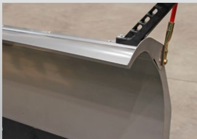
✎ Optional snow deflector in steel (straight-blade)